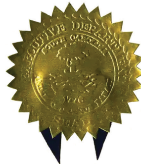
HENRY McMMASTER GOVERNOR STATE OF SOUTH CAROLINA

throughout the state and encourage all South Carolinians to join me in congratulating these students for their commitment to personal excellence.