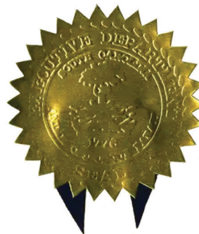
HENRY McMMASTER GOVERNOR STATE OF SOUTH CAROLINA

throughout the state and encourage all South Carolinians to join me in congratulating these students for their commitment to personal excellence.